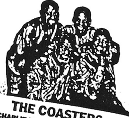
THE COASTERS "CHARLIE BROWN" - "YAKETY-YAK" "SMOKEY-JO'S CAFE" "YOUNG BLOOD" - "LITTLE EGYPT"