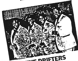
THE DRIFTERS "UNDER THE BOARDWALK" "UP ON THE ROOF" "SAVE THE LAST DANCE FOR ME" "THIS MAGIC MOMENT"