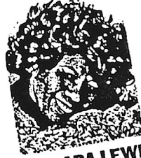
BARBARA LEWIS "MAKE ME YOUR BABY" "BABY, I'M YOURS" "HELLO STRANGER"