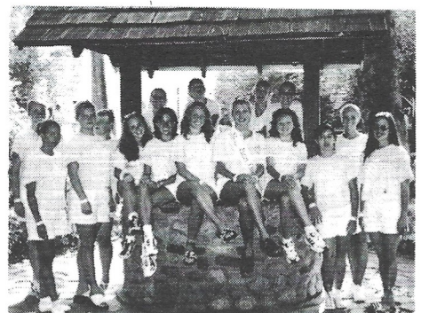
Miss Rain Day Contestants

Please join us and bring your guests. If you cannot attend please send your representative.