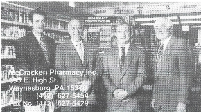
McCracken Pharmacy Inc. 695 E. High St. Waynesburg, PA 15370 (412) 627-5454 Fax No. (412) 627-5429

The Number One Source for News and Information in Greene County.