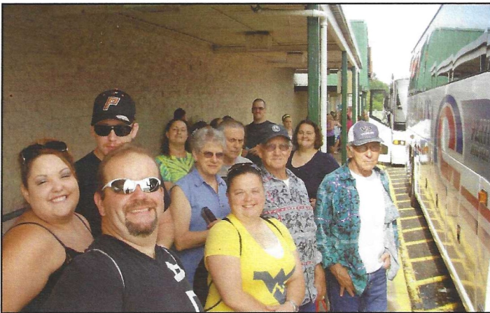
Smiling faces excited about going to Kennywood!