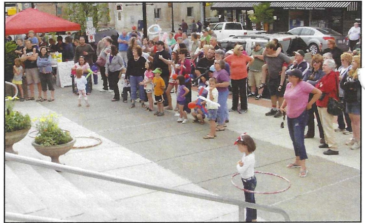
The crowd at Flashback Friday enjoying the Hula Hoop competition.