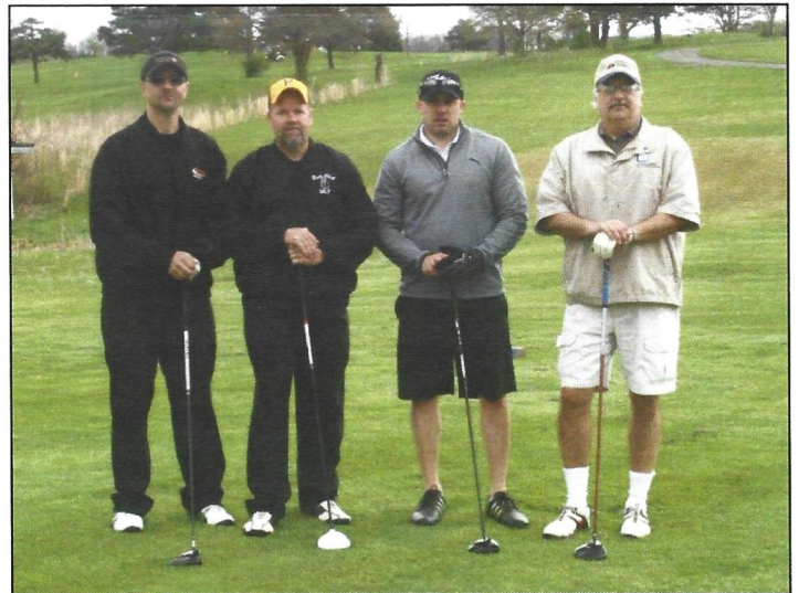
First Place Team - Mark IV Office Supply.

For a complete list of all donors, teams, players and winners in addition to more photos, please visit the Chamber's Facebook page or website at www.waynesburgchamber.com