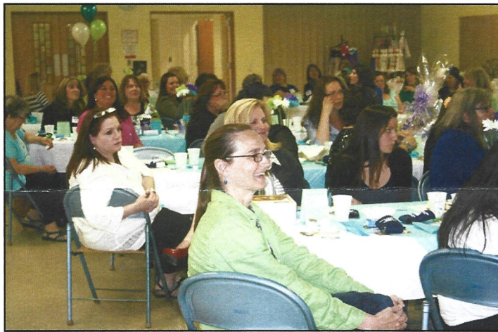
Nearly 100 guests enjoyed the Luncheon.