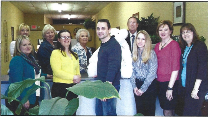
"Polly" is hiding among the Chamber Board members. Can you find her? Who knows where she will show up next.