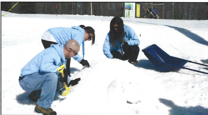
Bad News Polar Bears tackling the Snow Sculpture Challenge.