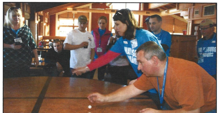
Waynesburg Warriors facing off against the Tough Truckers in the Minute To Win It games.