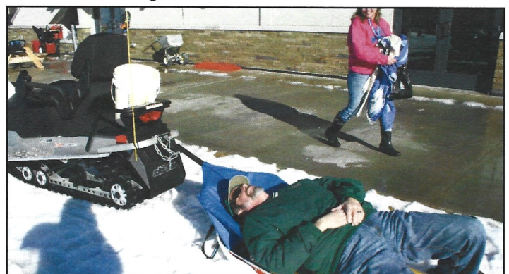
A member of the Lean Greene Fighting Machine taking a break from competition.