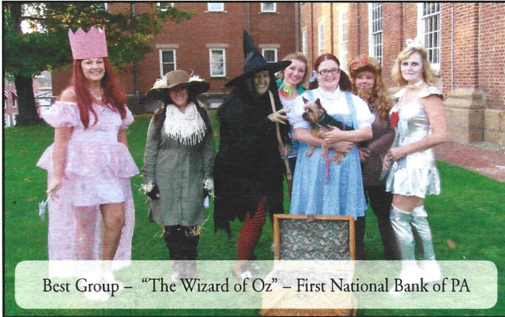
Best Group – “The Wizard of Oz” – First National Bank of PA