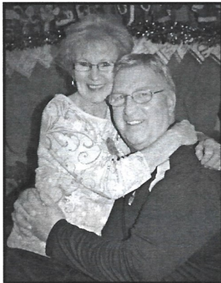
Gene & Judy Rush Individual Award

Presentation of the 2016 Distinguished Service Awards and the inaugural McCracken Legacy Award