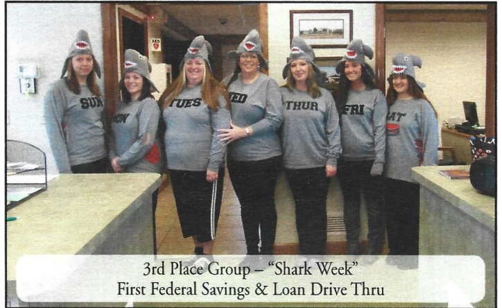
3rd Place Group – “Shark Week” First Federal Savings & Loan Drive Thru