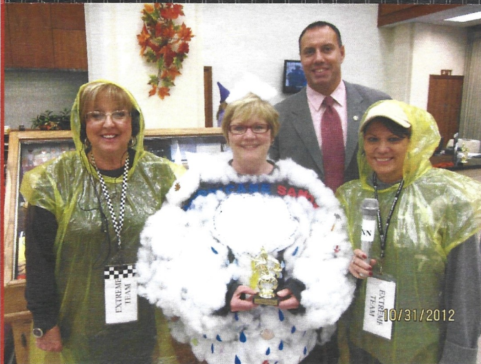
"2012 Most Original Costume – "Hurricane Sandy"