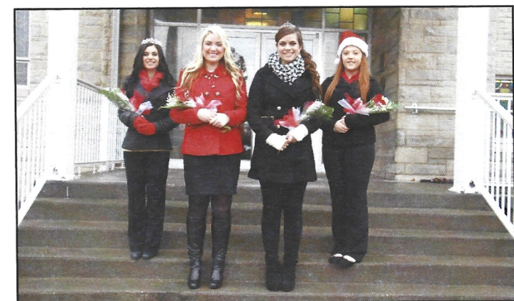
Miss Merry Christmas representing area high schools.