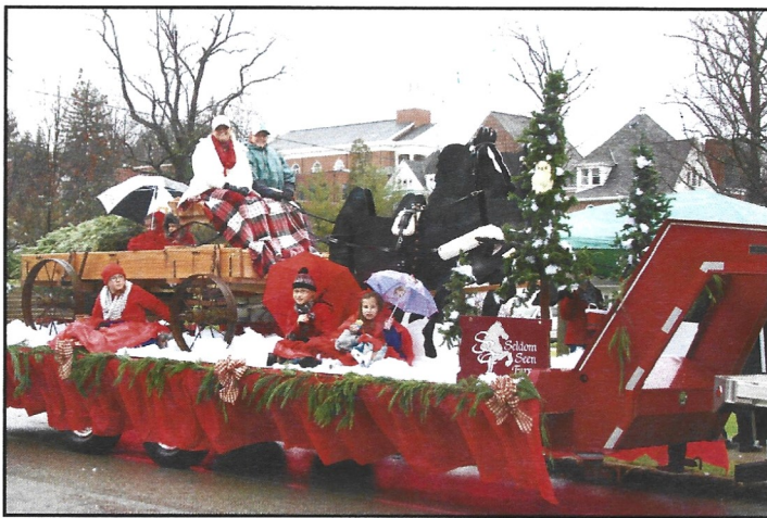
A beautiful float from Seldom Seen Farms