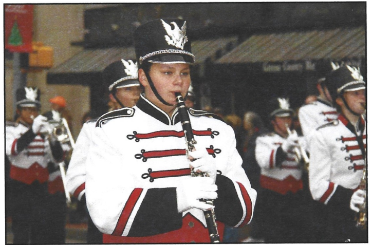
A member of the MBM Marching Band.

91 units participated in the parade and officially welcomed Santa into the downtown to kick-off the Holiday Season in Waynesburg.