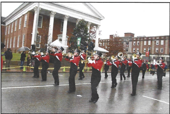
Waynesburg Central High School Marching Band