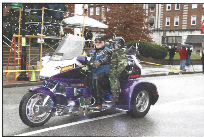
Member of Patriot's Dream Riding Association