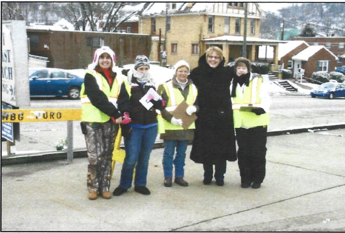
Some of the parade staff braving the cold to organize the parade units.