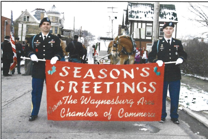
Members of the Penna. Army National Guard Readiness Center served as the banner carriers and opened the parade.

The parade can be viewed online at http://wctv.waynesburg.edu . Click the "Playlists" tab and scroll to the bottom of the program listings. Click "Waynesburg Christmas Parades" and select the first parade listed.