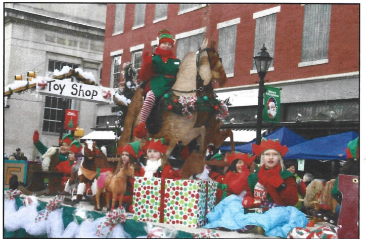
A beautiful parade float from Seldom Seen Farms.