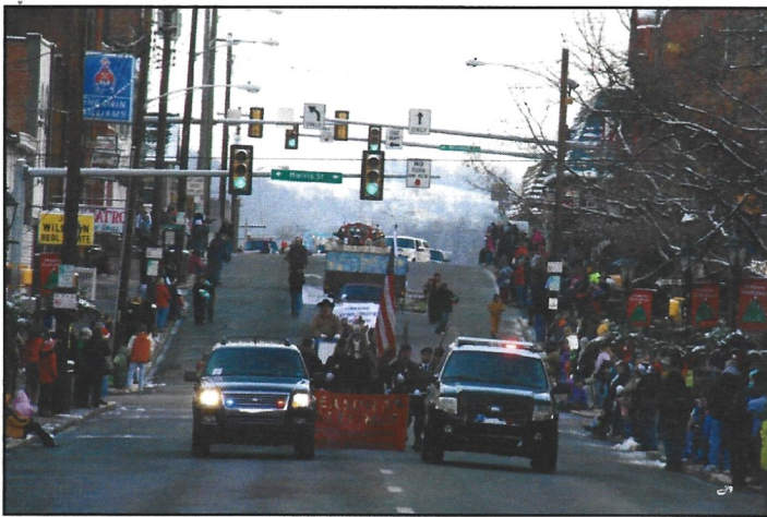
Here comes the parade!