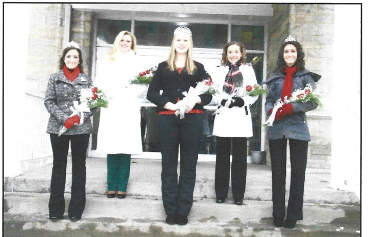
Miss Merry Christmas court members from all five county high schools.

Previous Waynesburg Christmas parades also are available online.