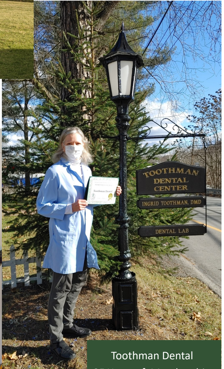
Toothman Dental 25 Years of Membership