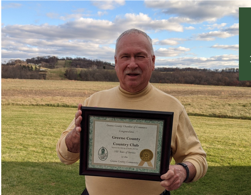
Greene County Country Club 100 Years of Membership