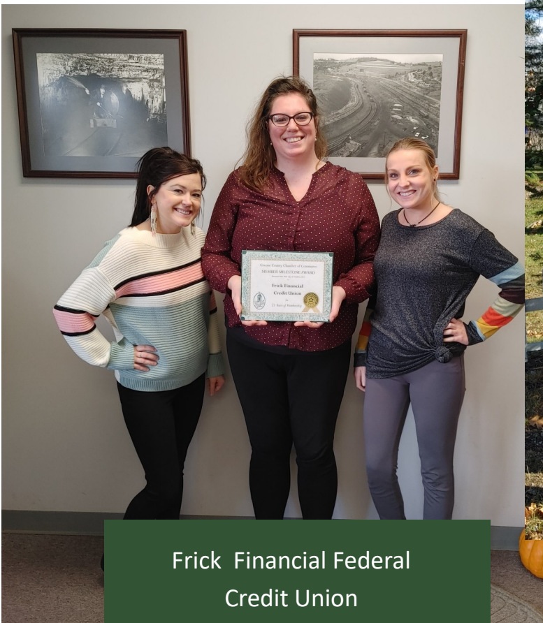
Frick Financial Federal Credit Union 25 Years of Membership