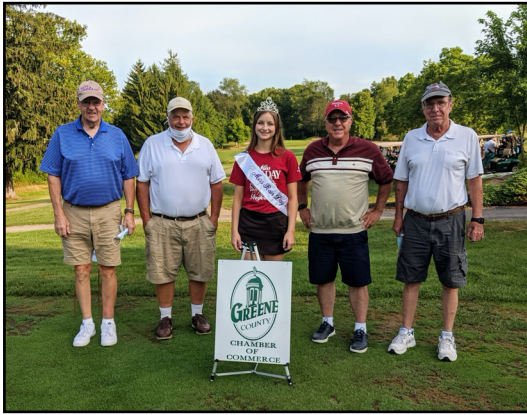
McCracken Pharmacy Team