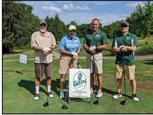
First Federal Savings & Loan Team