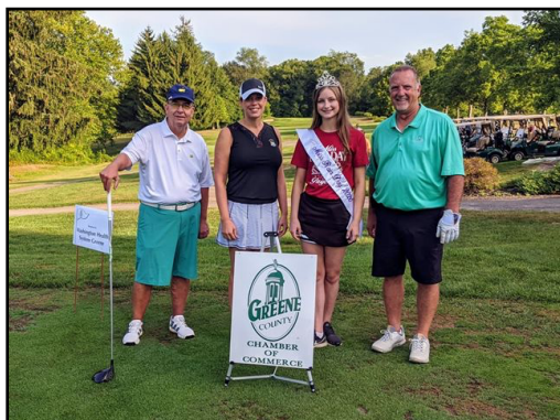
2nd Place Team: Washington Health System Greene