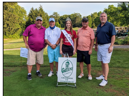
3rd Place Team: Greene County Country Club