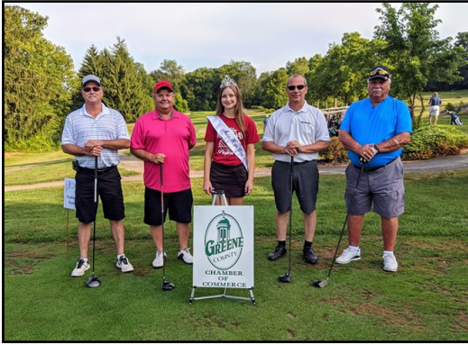
Belfor Property Restoration Team