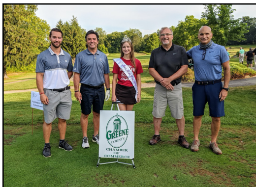
1st Place Team: First National Bank of Pa