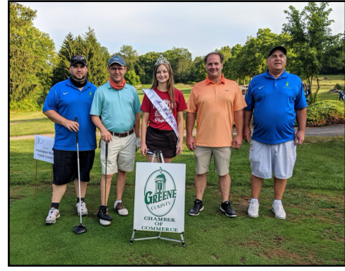
Lola Energy Team