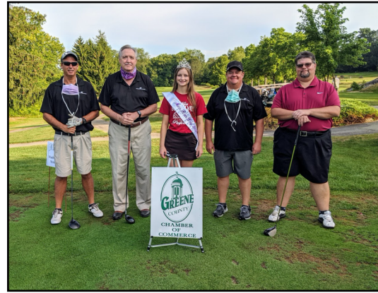
Washington Health System Team