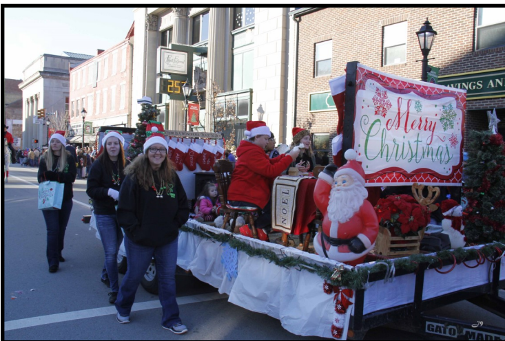
Most Spirit - GCCTC Practical Nursing Program