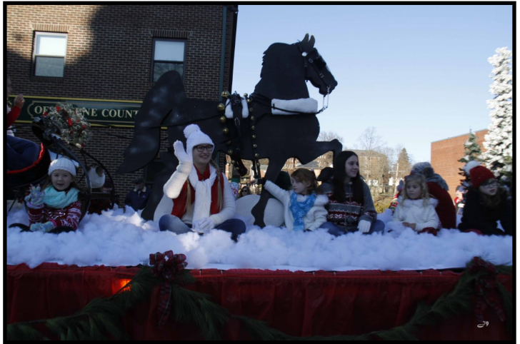
1st Place– Seldom Seen Farm