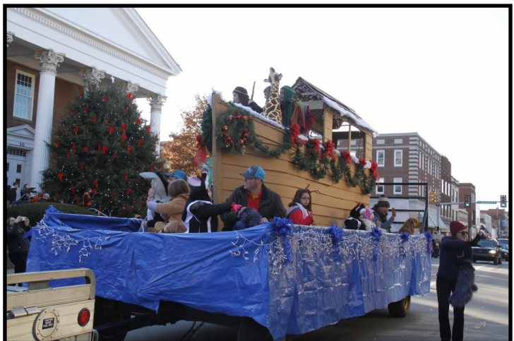
3rd Place - First Baptist Church of Waynesburg