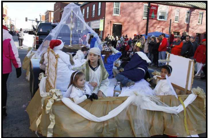
2nd Place – WWJD Christian Church