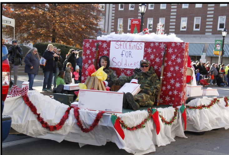
Most Original - Waynesburg VFW Auxiliary