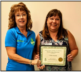
5 Kidz Kandy - 5 Years