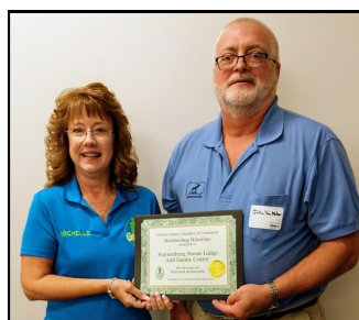
Waynesburg Moose Lodge & Family Center - 40 Years