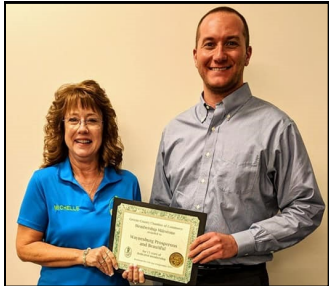
Waynesburg Prosperous & Beautiful - 15 Years