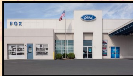
McCracken Legacy Award Fox Ford, Inc.