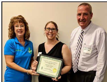
Greene County United Way - 20 Years