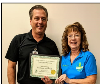
Waynesburg Health & Rehab - 35 Years