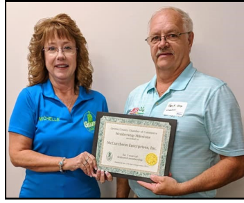
McCutchen Enterprises - 5 Years