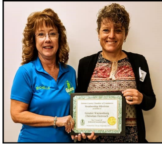
Greater Waynesburg Christian Outreach - 5 Years