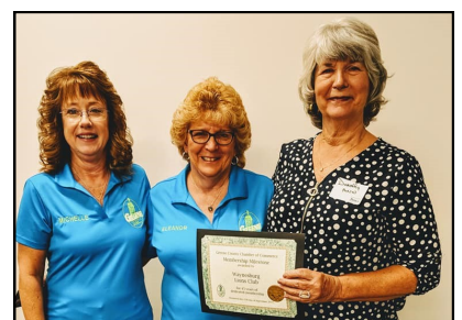
Waynesburg Lions Club - 45 Years

Also receiving milestone awards but were not present are: Wade's Body & Frame Shop, Consol Energy, McCracken Pharmacy, Barton's Auto Wrecking, Bridge Street Commons, EMS Southwest, Greene County Habitat for Humanity, GreeneSpeak Publications, Comcast Business Services, D. Moore & Sons Monuments, Hoy's Construction Company, In Motion Dance and Fitness, Mt. Morris Gospel Tabernacle, Walmart, Back Bay Catering, Chevron Appalachia, Express Employment Professionals, K Daniels Custom Graphics, McNay Excavating, MedExpress Urgent Care, Skyview Drive In, Tentmakers, WWJD Christian Center, Xtreme Services.