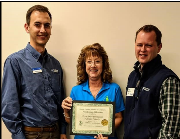
Penn State Cooperative Extension Greene County - 20 Years