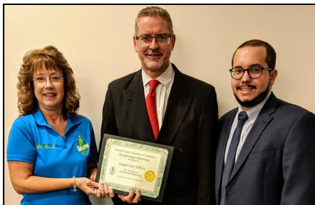
Logan Law Office - 20 Years