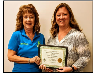
Donnelly-Boland Associates - 10 Years