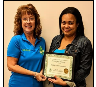
Bridge Street Commons - 20 Years