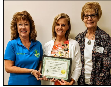
Pennsylvania Careerlink of Greene County - 20 Years