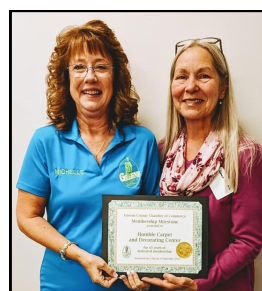
Humble Carpet & Decorating Center - 45 Years