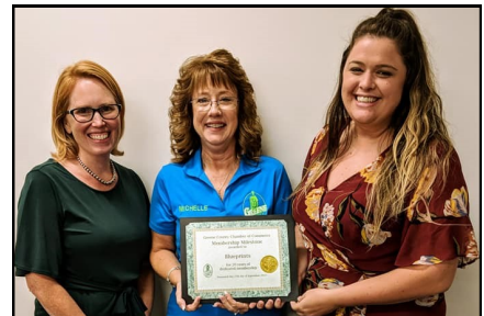
Blueprints - 20 Years