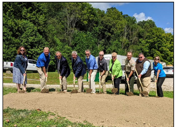
Several state and local officials attended the ground breaking celebration.