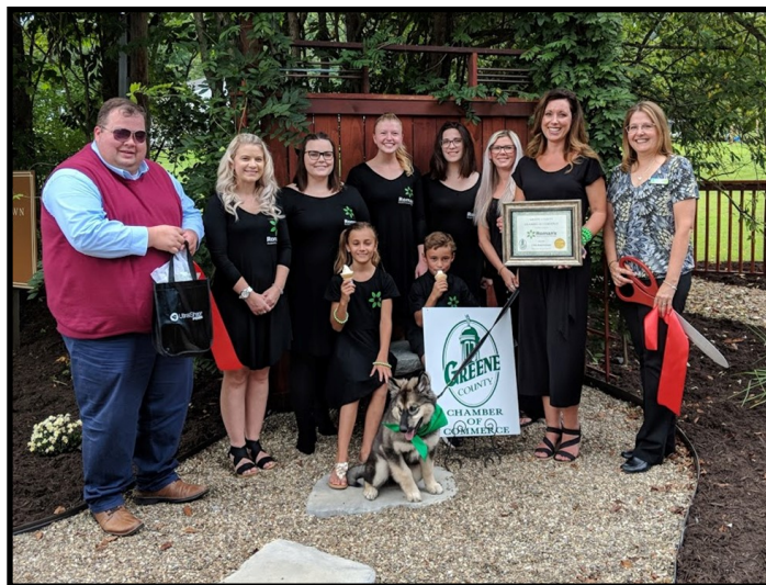
The great team of Roman's!