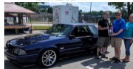
Best in Show Veteran Owned