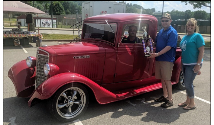
Best in Show Veteran Owned - 1934 International