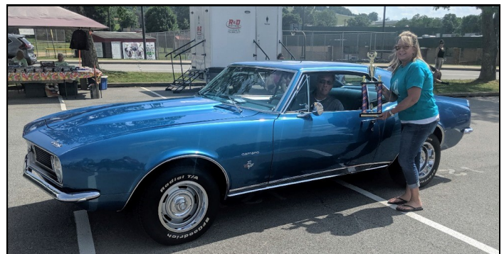
President's Choice - 1967 Chevy Camaro