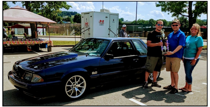
Best in Show - 1991 Ford Mustang