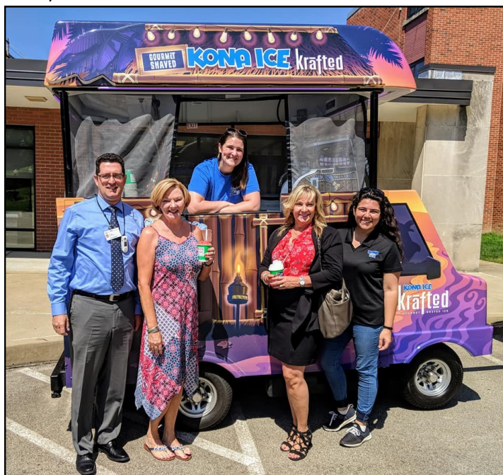
Guests enjoying Almost Heaven Kona Ice!