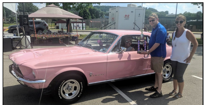
Event Sponsor Choice - 1967 Ford Mustang