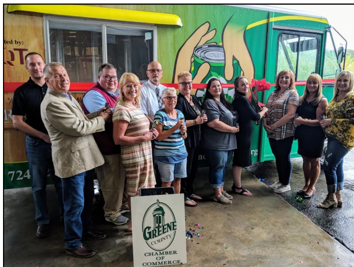
Cutting the Ribbon to celebrate the "Greene Machine"

During the Corner Cupboard Food Bank's Open House, we dedicated the "Greene Machine" with a ribbon cutting. The "Greene Machine" was donated by EQT and allows the food bank to serve over 2,000 residents in Greene County each month. Guests also enjoyed a tour of the food bank and cooking using foods from a typical pantry box. It was a great evening celebrating all that the Corner Cupboard Food Bank does for the Greene County Community!