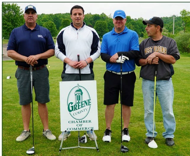
First Place Team