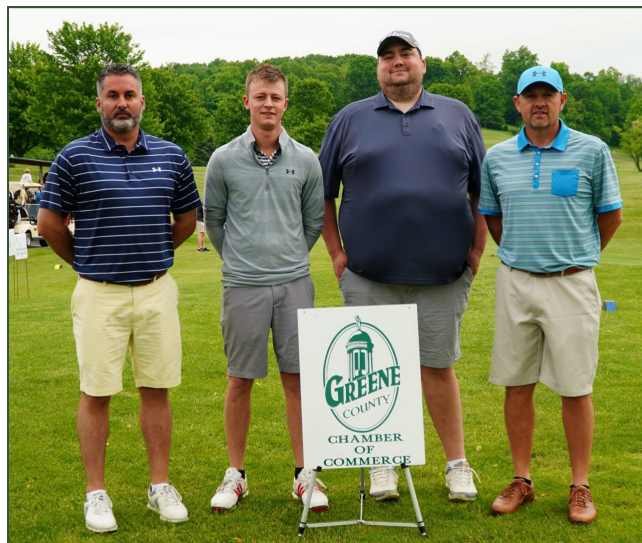
Second Place Team