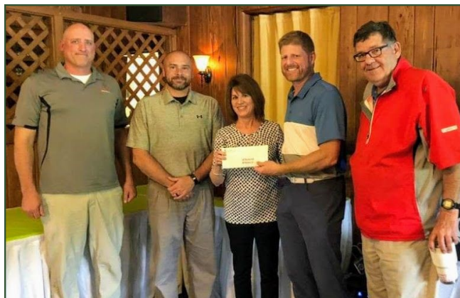
Third Place Team