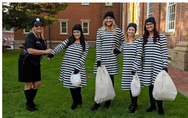
Most Original – “Cop & Robbers” First National Bank of PA