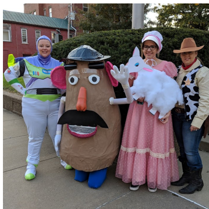
Best Group – “Toy Story” Logan Law Office