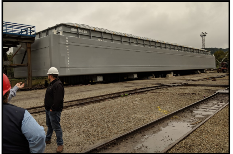
A nearly complete grain barge