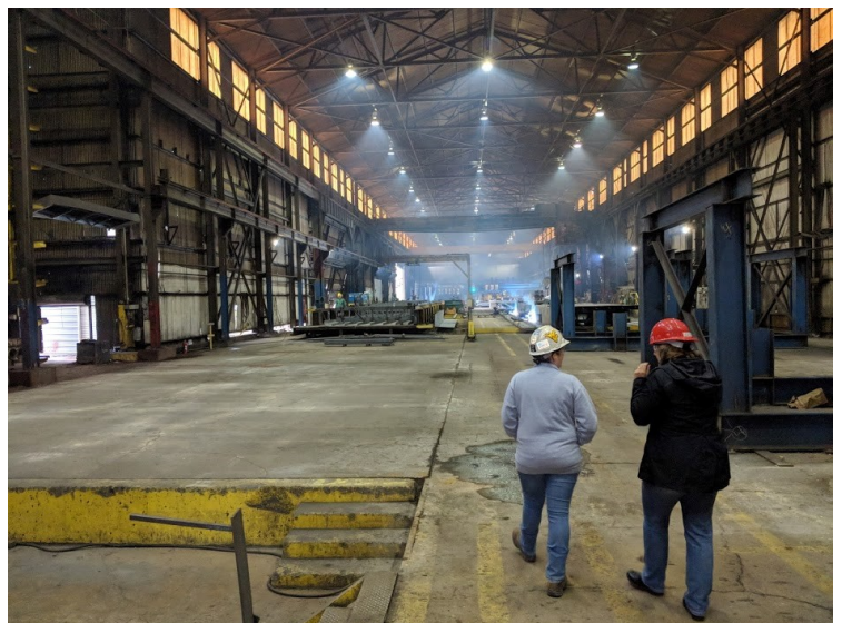
One of the many assembly lines at Heartland