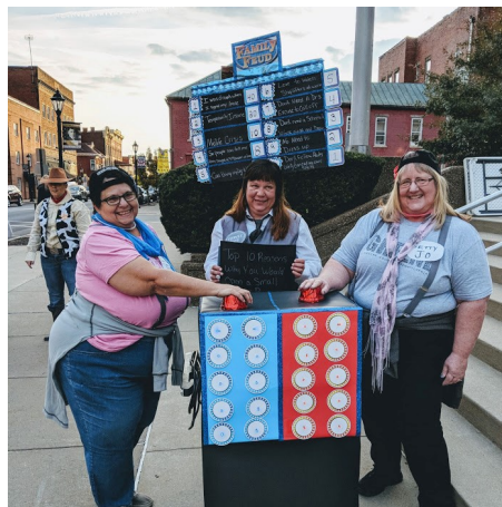
Most Entertaining – “Family Feud” Ruff Creek Crafts, 5 Kidz Kandy, Fischer Antiques