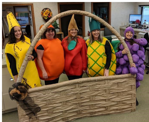
2 nd Place Group – “Fruit Basket” First Federal Drive Thru