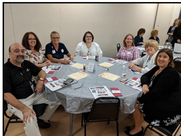
Members of the Washington Health System staff enjoying the luncheon