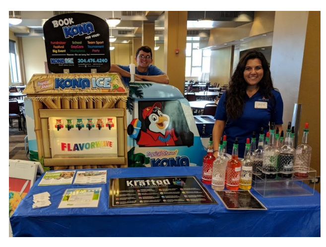
Almost Heaven Kona Ice provided a sweet summer treat for all our guests!