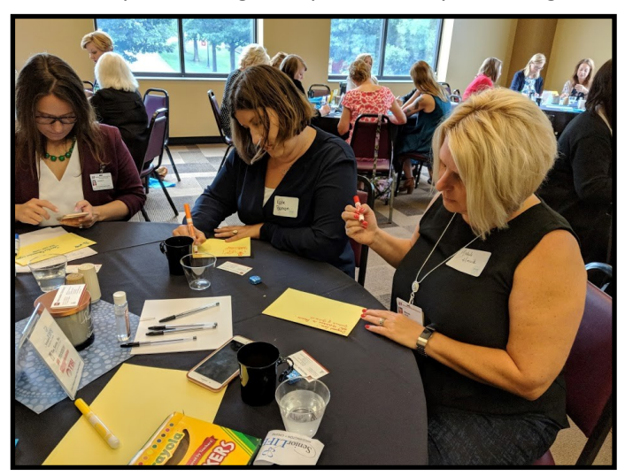
Guests participating in the networking activities.