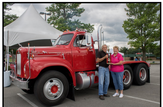
Event Sponsor Choice - 1965 Mack B61