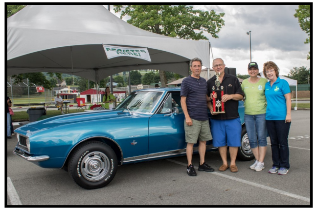
Best in Show - 1967 Chevy Camaro