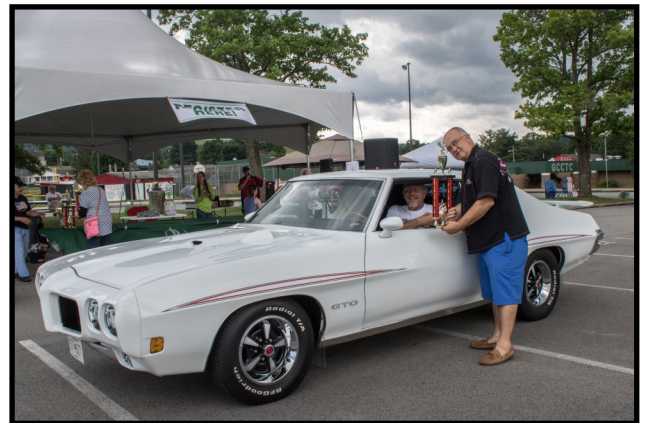
President’s Choice - 1970 Pontiac GTO