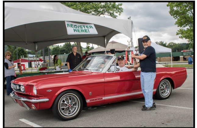
Best in Show Veteran Owned - 1966 Ford Mustang