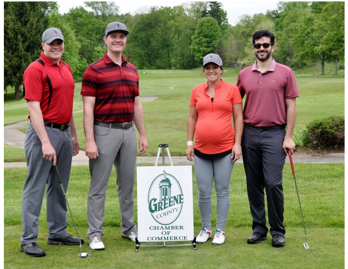
First Place: MR Structures