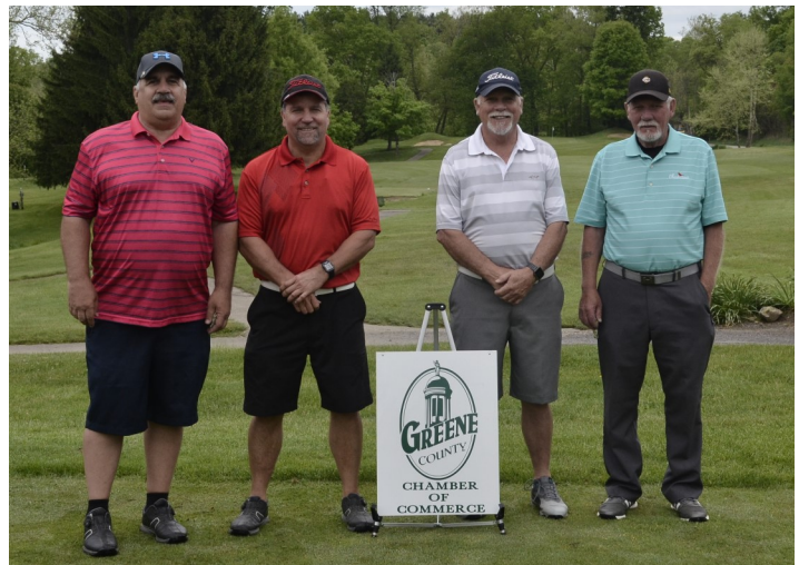
Third Place: Greene County Country Club