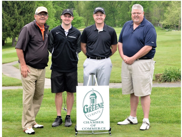
Second Place: Waynesburg University