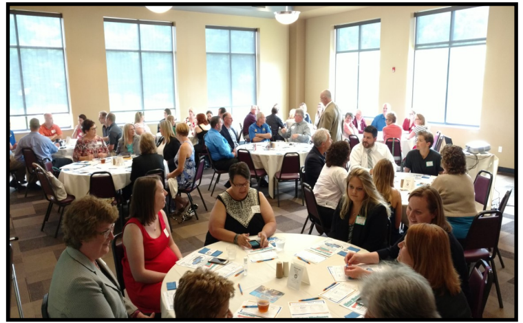
Guests enjoyed a great afternoon of networking and delicious food!