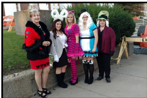
Best Group – “Alice In Wonderland” First National Bank of PA