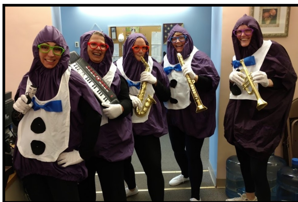
Most Entertaining – “The California Raisins” Greene County Clerk of Courts office