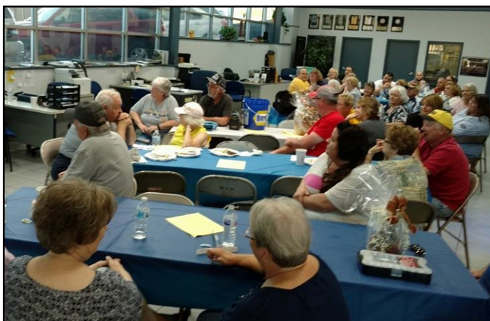
Participants waiting for results

The Chamber's Scholarship was once again chosen as the recipient of the event proceeds and we are very thankful. Thank you to all who participated!