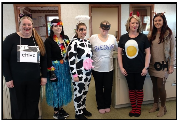
Most Original – “We Like our Puns Intended” First Federal Drive Thru