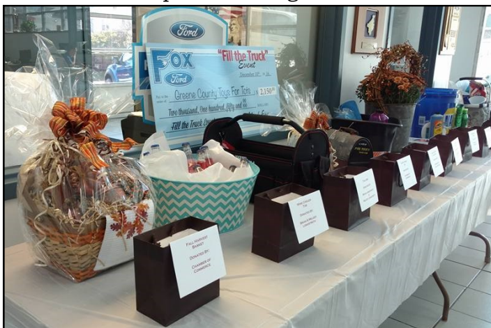
Chinese Auction Items