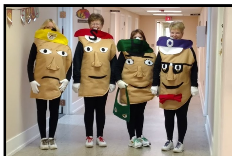
3 rd Place Group – “The Pittsburgh Pierogis” Greene County Treasurer’s Office