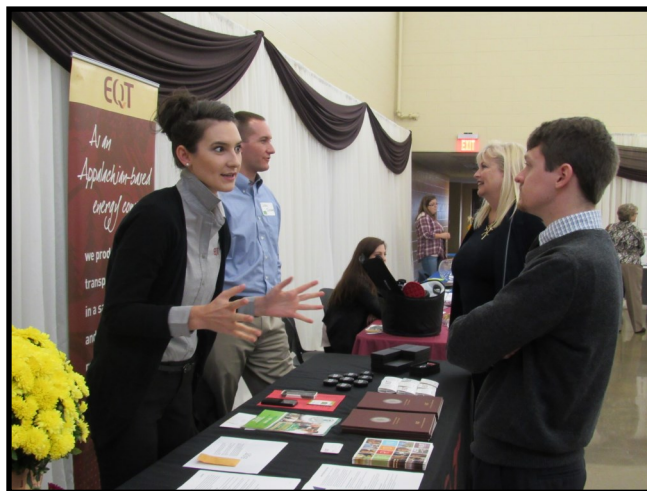
Last year's event was a big hit!

Sponsorship opportunities are still available. For more details on each sponsorship package, please contact the Chamber office at 724-627-5926 or info@greenechamber.org .