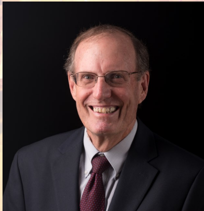
Chuck Bailly Distinguished Service Award

Presentation of the 2017 Distinguished Service Awards And the inaugural McCracken Legacy Award