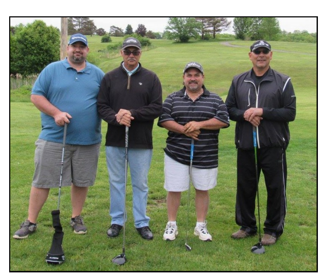
Second Place: Team Waynesburg VFW Post # 4793