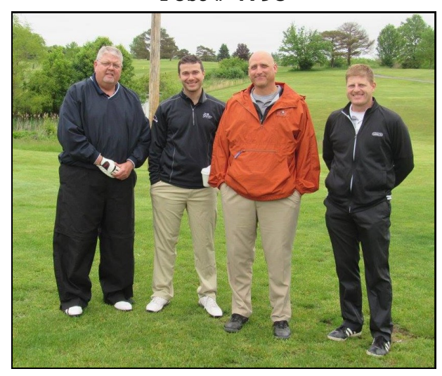
Third Place: Team Waynesburg University