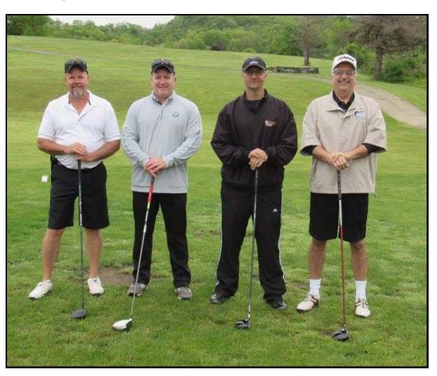
First Place: Team Mark IV