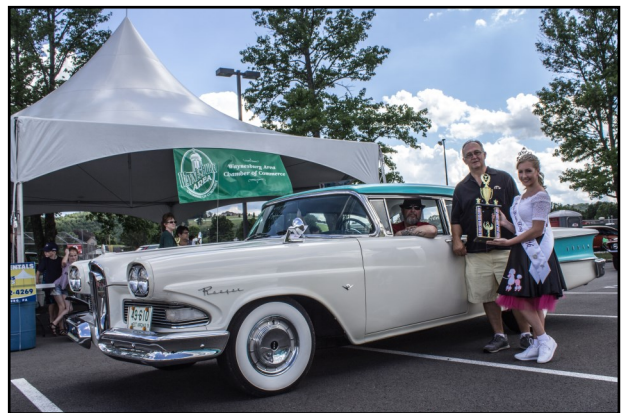
President's Choice - 1958 Edsel Ranger