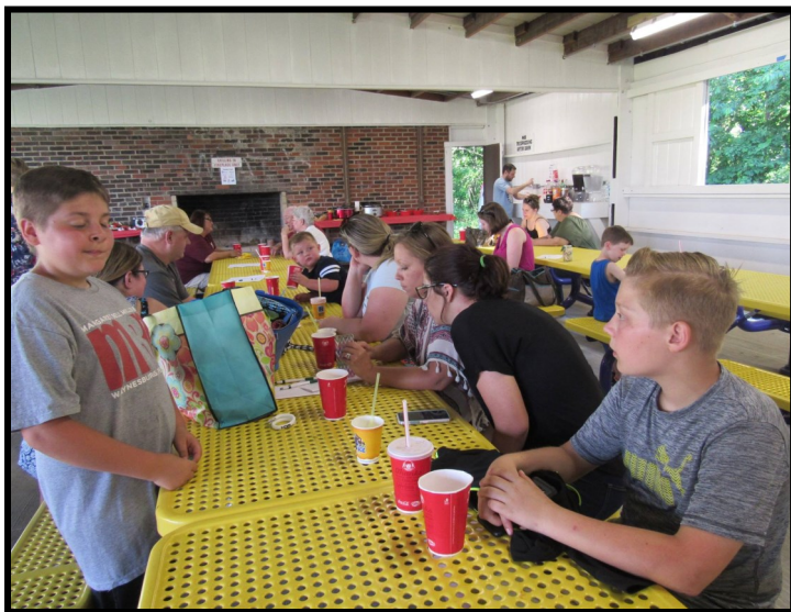
The evening was enjoyed by all!