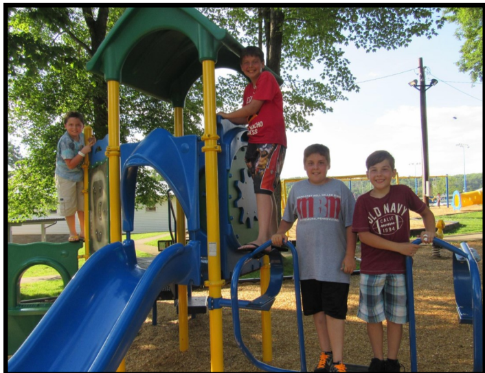
There was fun for the whole family!