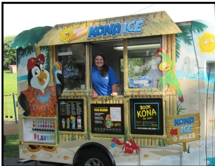
Guest enjoyed the many flavors of Kona Ice!