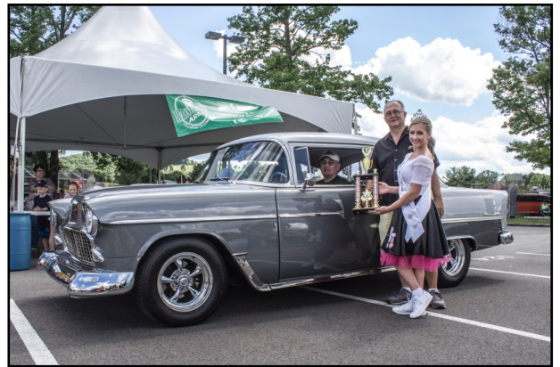
Best in Show - 1955 Chevy Belair