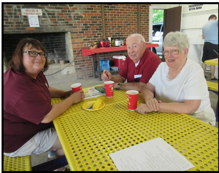
Lots of Networking and FUN!